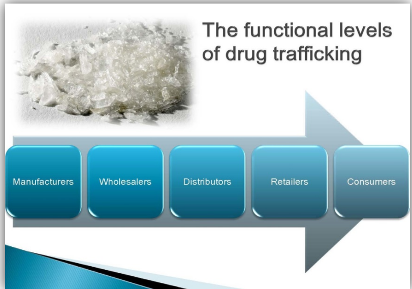
Figure 1: Functional levels of drug trafficking (Abadinsky, 2013)

But it is knowing what criminal networks are operating, and at what level that is the key to an effective law enforcement response.